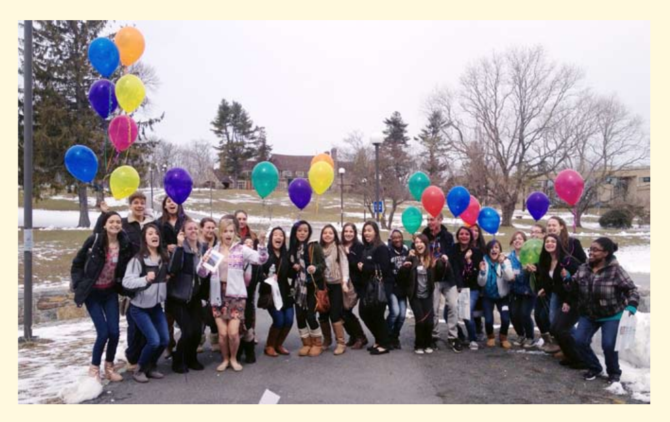
WESTLAKE HIGH SCHOOL students, waiting, on the WCC campus, for the bus home!!!!!!