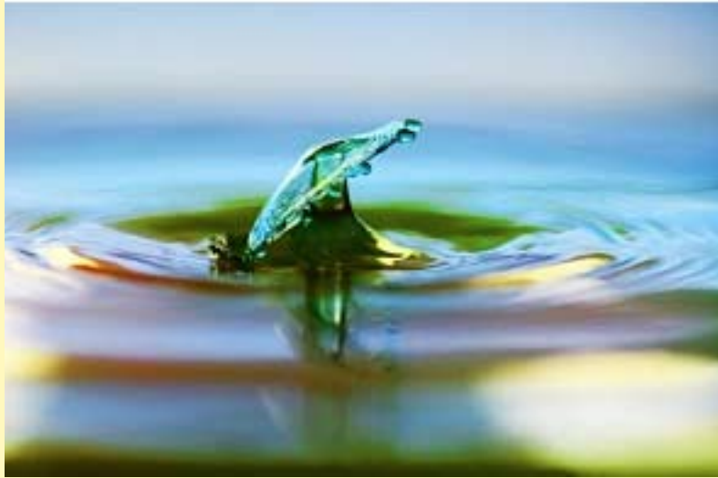
Harrison High School Lower Hudson Region