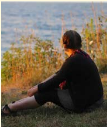
SUNY Oswego on the shores of Lake Ontario, host to the NYS Summer School of Media Arts!