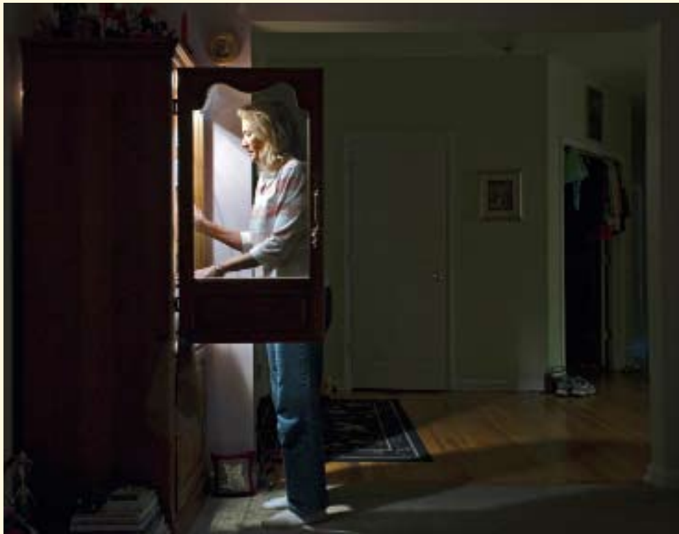
"Touched by Light"