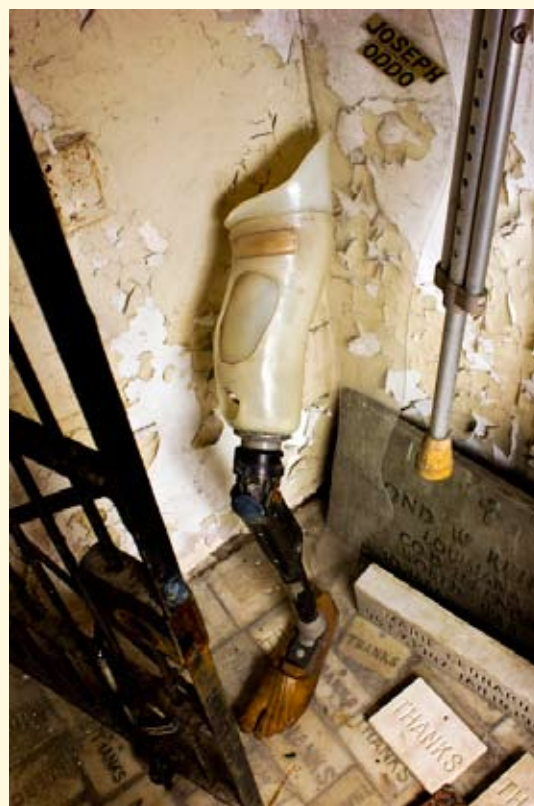
Beca Piascik Leg (from the series, Lost Items) 2014 18" x 12" Inkjet print