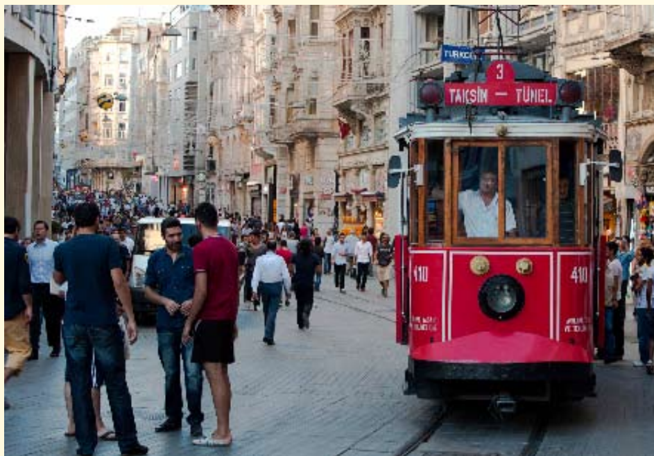
Metin Ozisik Red Trolley 12" x 16" Inkjet print