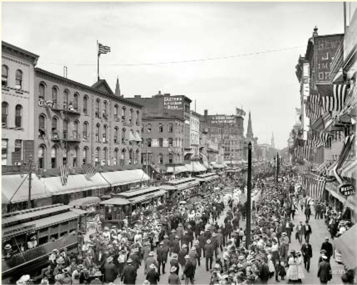
Buffalo, NY Labor Day Parade / Main Street / 1900