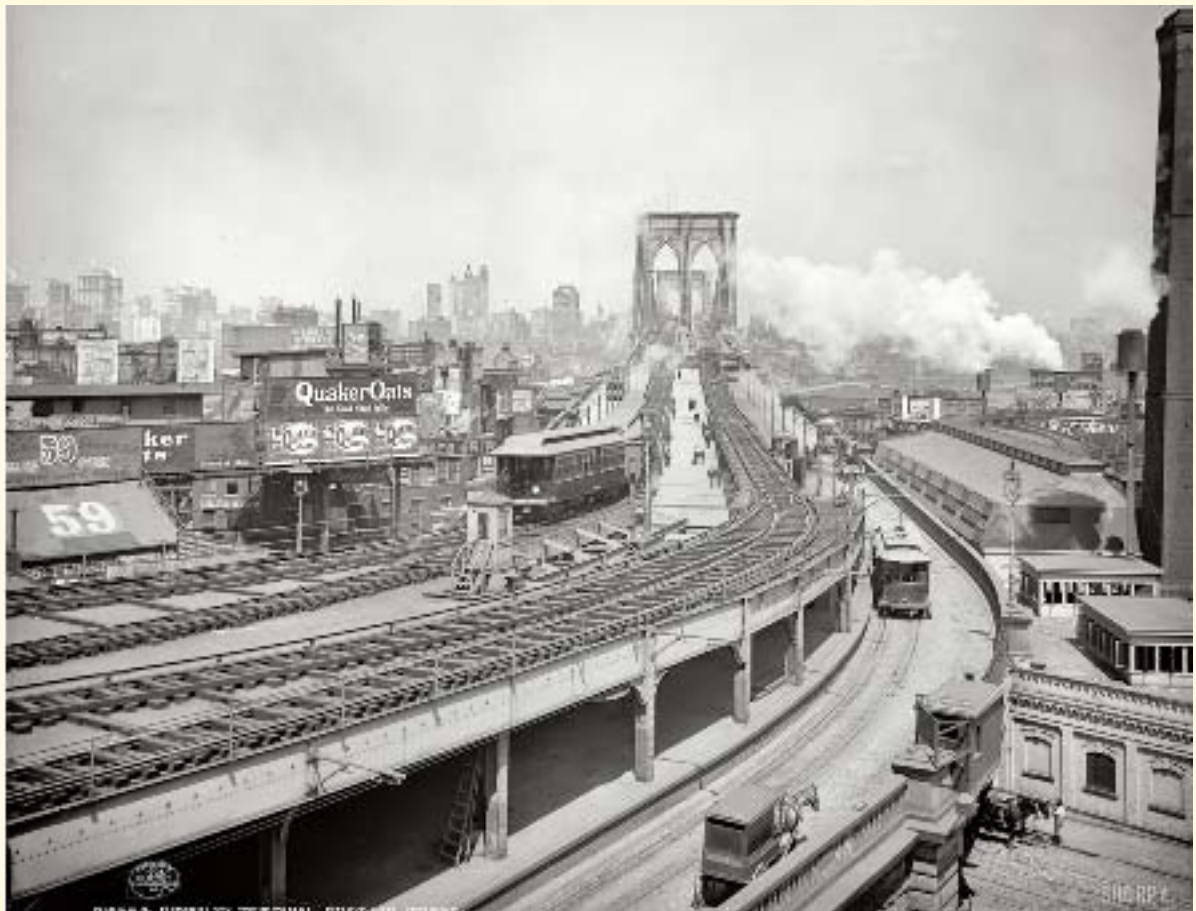
Brooklyn Terminal at Brooklyn Bridge / 1903