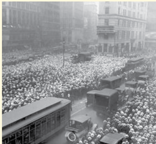
Times Square / 1916