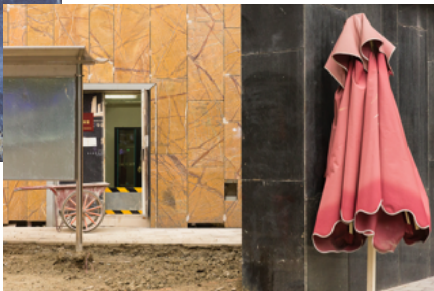
Photography: Other FIRST PLACE - Yushi Li, The Red Umbrella (Niskayuna)