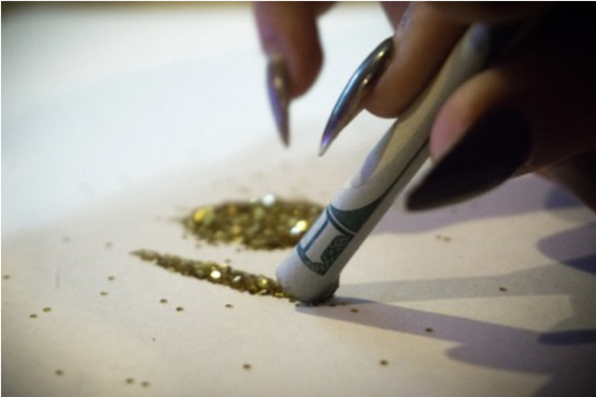
Emad Jamal earned Silver for Blow