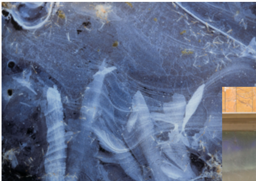
Photography: Landscape / Nature FIRST PLACE - Bhadji Reddy, Blue Ice (Emma Willard)