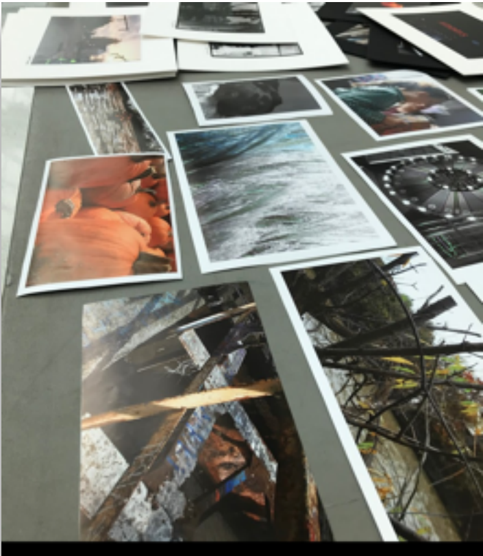
Student photography was varied and demonstrated great skill.