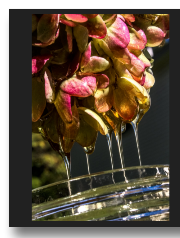
24 Honey Series #5 Anita Reitano Averill Park

Category 3 PHOTOGRAPHY: Still Life, Objects or Interior Space Second Place