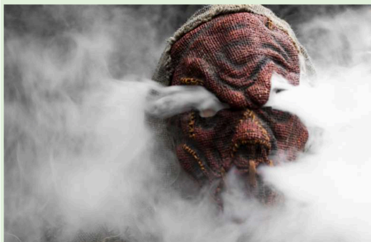
Murder on the Oxbow