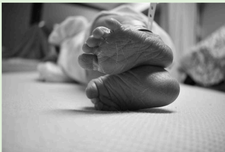
Stepping into Life