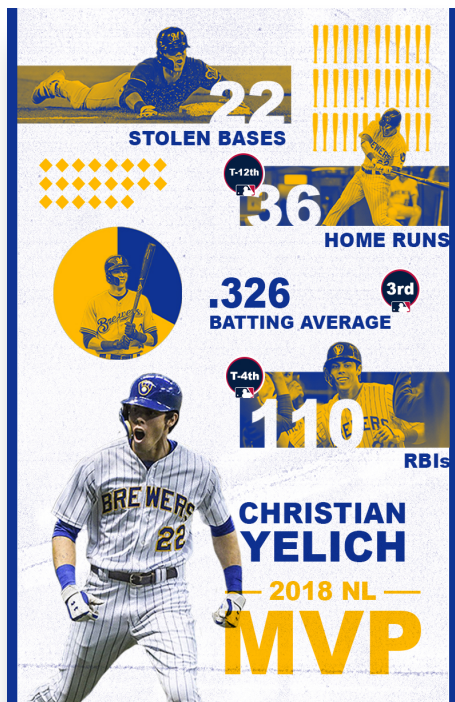
DESIGN: Visual Identities and Marketing Materials