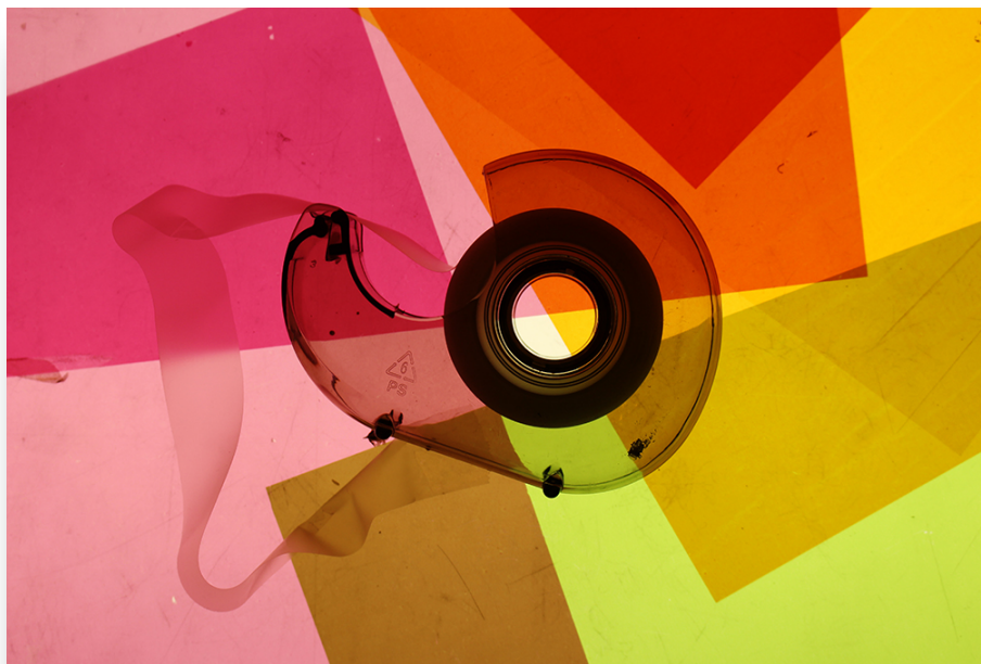
“Colors Abstracted” by Darby Siver, Grade 11, Ichabod Crane, AWARDED 1st Place