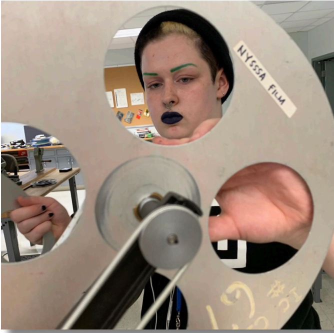
Film students working on hand painted films and animation students starting their projects.