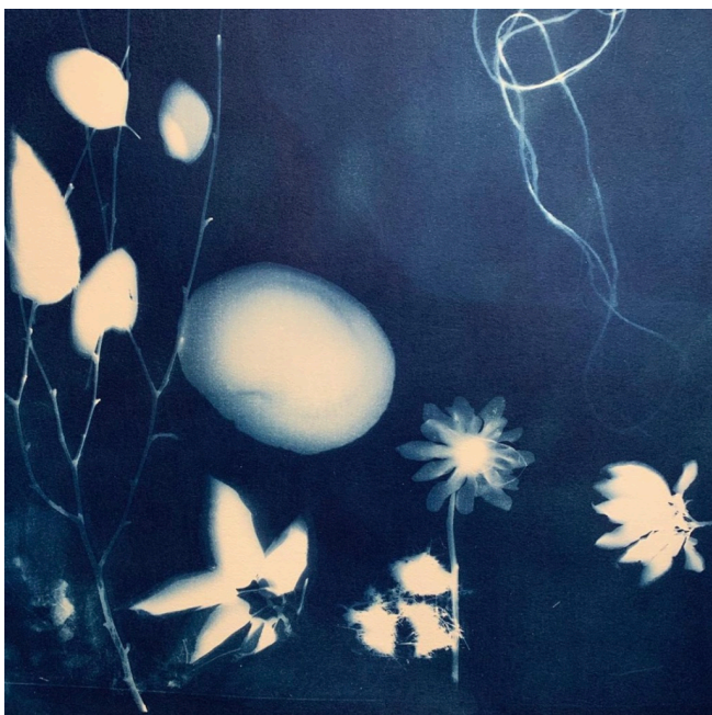
Photo class made cyanotype print studies.